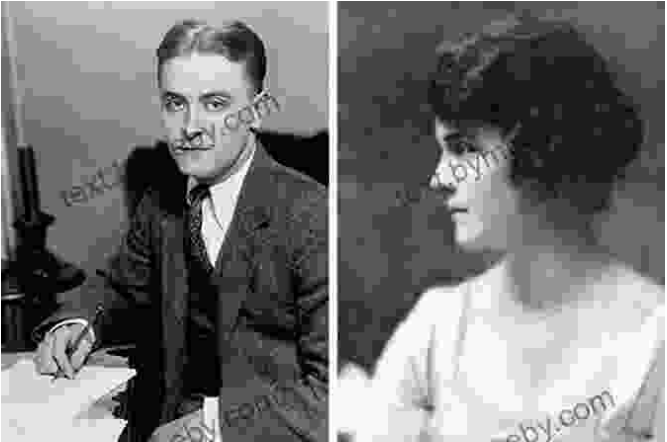
Scott Fitzgerald and Ginevra King, a couple in love and a literary inspiration