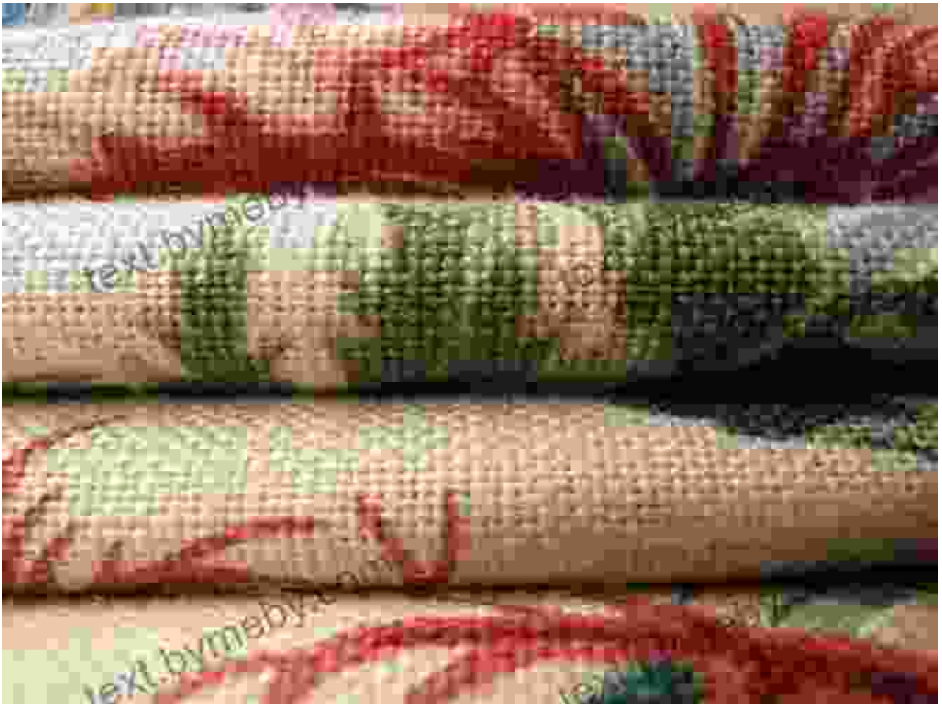
Close-up of textile fabric showcasing a range of textures inspired by nature